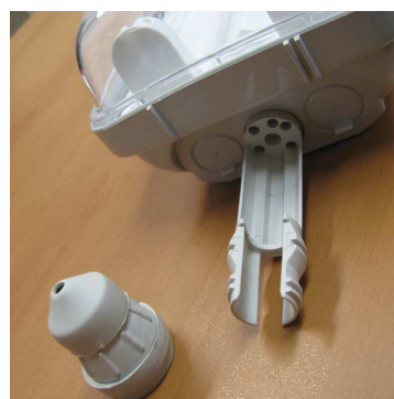
Watertight screw nut