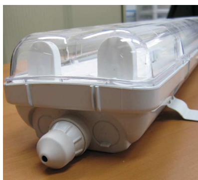
External wiring (installation)